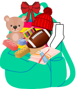
Appalachian Christmas Backpacks