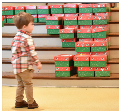
The UMOF supports Operation Christmas Child at FBC.

We mobilize the entire church, especially making it possible for the children and youth in our Wednesday night programs, to fill shoe boxes with Christmas gifts for children around the world. Many of our members volunteer to make this ministry possible.