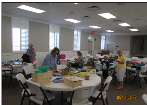
Women on Mission partner with UMOF to provide backpacks filled with school supplies for needy children at Cornelia Elementary.